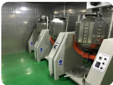
11、 Ball milling