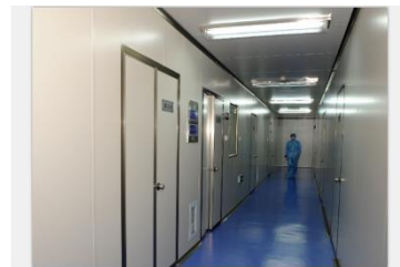
10、 Purification zone