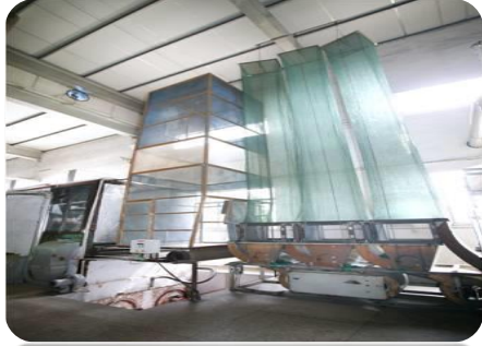
5、 Wind Cooling