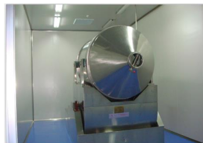
12、 Mixed packing